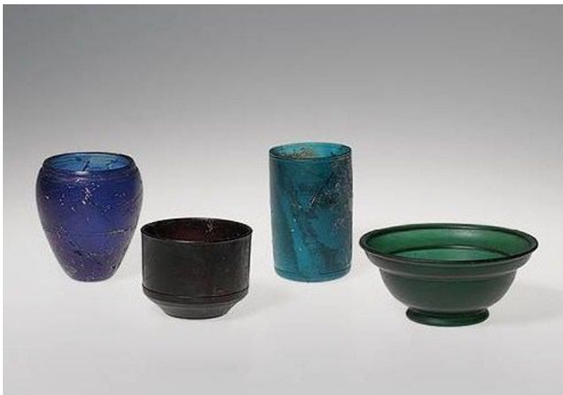
Miscellaneous glassware from the Roman era

Petronius in “The Satyricon” relates a strange story of a glassmaker who invented an unbreakable jug, which he demonstrates before Caesar by hurling it down on the marble floor and hitting it with a hammer, from which it emerges unscathed. On learning that the glassmaker is the sole repository of the secret of how