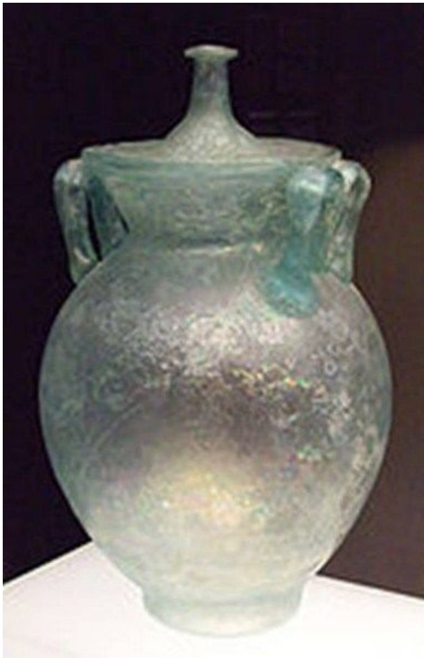
A lidded bowl from the First Century

cooled, they scraped out the clay to make the bottle.