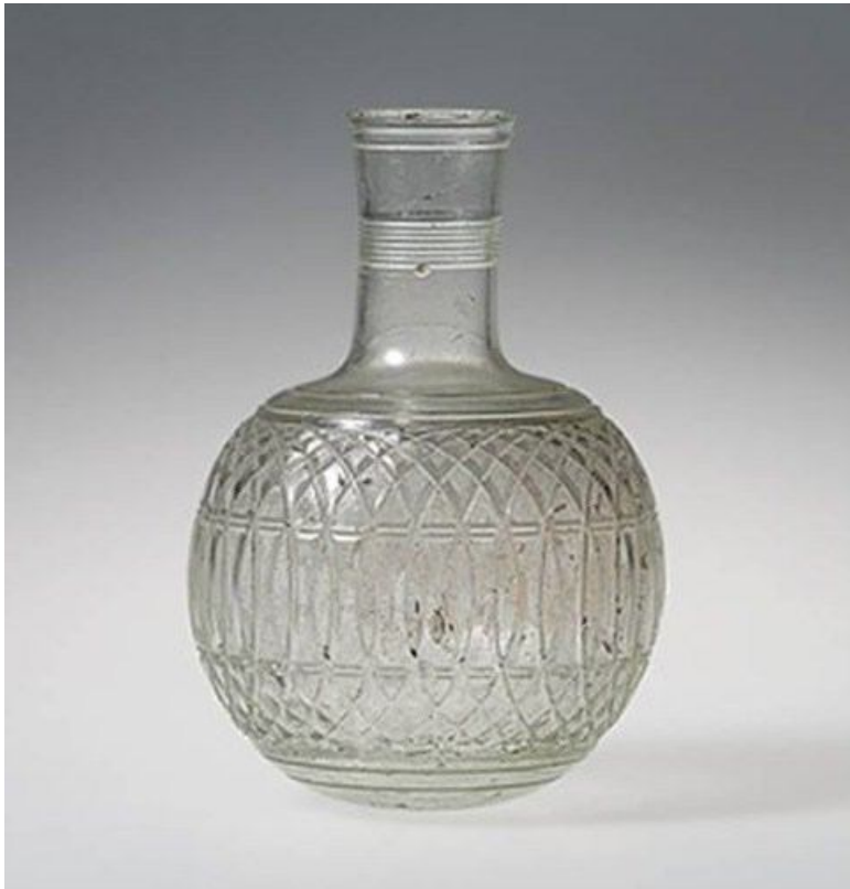
A Roman cut glass decanter from the First Century

introduction of glass had on the Roman world and its role in the subsequent development of Western civilization.